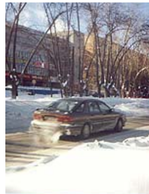
Russian winter is definitely not the best time to visit Russia. The temperatures of 20-25 C below zero (minus 4 F) are nothing special. (On the picture: VIZ boulevard, Ekaterinburg, Russia )