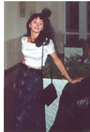
The majority of women in Russia are slim, attractive, and look young