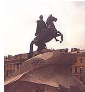
The Bronze Horseman, Decembrists' Square (formerly Senate Square), St Petersburg - memorial to Peter the Great, which had become an unofficial emblem of the city. Peter was the founder of St Petersburg, and it was his wish to move the capital from Moscow to the new city. The words on the stone say "To Peter the First from Ekaterina the Second". Ekaterina II was Peter's daughter. Built in 1733.