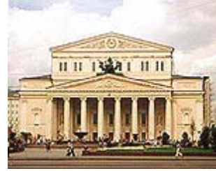
Bolshoy Theatre , Moscow (1825, architect Bove) - nevertheless its waning glory, Bolshoy is still considered one of the best opera and ballet theatres in Europe and the world. As with many other things, tickets for foreigners are more expensive than for Russian citizens!

The shopping center was packed with people and for the first time I had the opportunity to look at the people. I was impressed with the people, especially the neat and