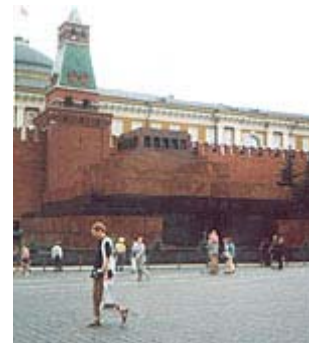
Mausoleum is no longer the main attraction of the Red Square.