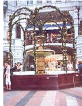
Fountain at the center of GUM - the meeting place if you have lost one another at the shop. (The announcements on radio is always that you should meet each other here.)