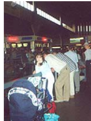
Sheremetevo 2 was built in the early 1970's, during the times of the cold war. It is by far too small for today's busy international life. Long queues and lack of waiting rooms don't make a favorable impression.