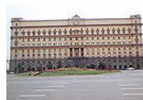
One of the scariest places in the world - KGB on Lubyanka Square in