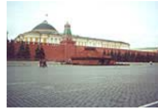
Mausoleum of Lenin on the Red Square, Moscow. The body of "The First Bolshevik", the leader of October takeover of 1917 and the founder of the USSR, Vladimir Ul'yanov (conspiracy nickname "Lenin") was embalmed after his death, and placed in specially built (1929-30) Mausoleum for public access. During the Soviet times the queues to have a look at the mummy used to reach 5-6 km (3-3.5 miles). Today the public access is denied, and rumors have it that the body was removed from Mausoleum. Another famous Mausoleum is in Hanoi, Vietnam, and is built to memorize yet another famous communist, Ho Chi Minh.

The correspondence and a possible future relationship with a Russian woman were so exciting for me. There was some indescribable mystery, the unknown of someone foreign. But despite of my sound knowledge of foreign countries and their realities (foreign countries were always my passion), it did not make me an expert in foreign relationships. I can tell you, foreign knowledge