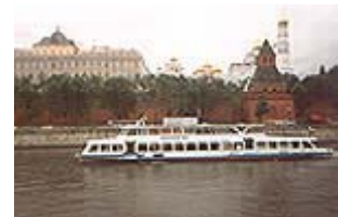
The opposite side of the Kremlin if facing the Moscow River. There are a few cathedrals on the territory of Kremlin; you can see its gold plated roofs on the picture.