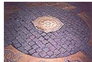
"The point" , Moscow, close the Red Square - this is the starting point of Russia. All distances are measured from this point.