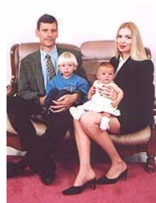
And our beautiful family