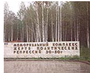
The monument of civil victims (Moscow highway, outside Ekaterinburg)