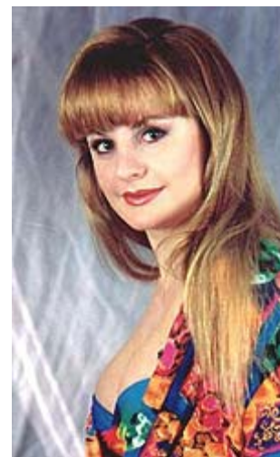
All those beautiful women from Russian dating agencies are real - I've seen them with my own eyes!