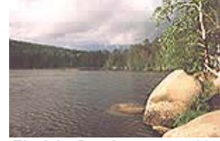
The lake Peschanoye outside Ekaterinburg, Russia

I departed from Ekaterinburg Tuesday morning after five days of a very pleasant and memorable stay. The flight departs early morning at seven and scheduled to arrive also at seven in Moscow so I could "catch up" the missing two hours of my life that disappeared on my way to Ekaterinburg. Russia has eleven time zones.