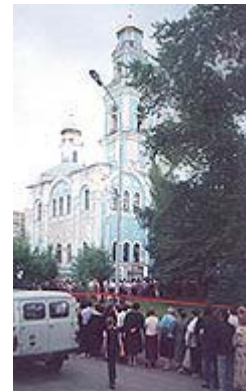
The queue to the Vosnesenskaya Cathedral during the ceremony of reburial of the remains of the Tsar's family (16 July 1998, 80 years after their death). The Cathedral is situated right in front of the place of Tsar's execution. During the Soviet time the Cathedral was the museum of natural sciences, and was given back to the Russian Orthodox Church only in the middle 1990's.

After the execution, the remains of the family were buried at an unknown place about twenty kilometers outside Ekaterinburg. After perestroika in 1987 it was established where they were buried and the remains were found. After many tests the remains were identified as the tsar's and his family. The remains of the youngest daughter, Anastasia and the youngest son, Mikhail have never been found. Many people believe that the two kids were never executed and the possibility exists that someone else could have brought them up. The official Russian version is that the two youngest kids were buried somewhere else.