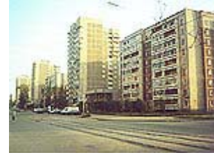
Vikulova Street, Ekaterinburg - a typical residential area of a big city. The vast majority of Russians live in flats in such blocks.