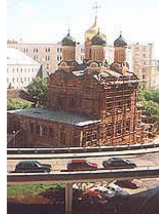
Church at the hotel "Rossia", Moscow, Russia - I took this picture from my room window. At that time it was still in the process of renovation.

By the way, you must know that it is virtually impossible for a single Russian girl to get a visitor's visa to USA (as well as to other countries like Canada or Australia) because of the immigration rules. The immigration