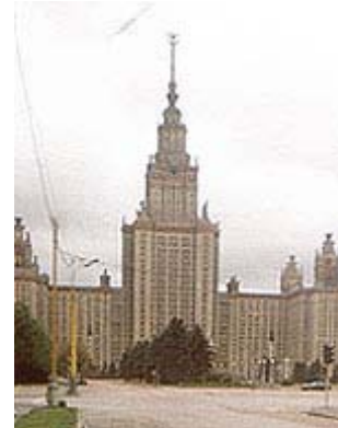
Moscow University on Lenin's Hills - the tallest building in Moscow (since fire destroyed Ostankino's TV tower in 1999)

We arrived at Domodedovo domestic airport an hour before the departure time. You also need to know that at Russian airports you should be there at least 45 minutes before the flight. They register you first, and then you go through another gate for the security check and then wait for your plane at the lounge. If you arrive at the