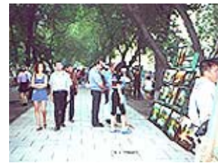
Artists' exhibition in the park in the city center; Lenina Avenue, between the Square of 1905 Year and Khokhryakova Street. Open daily.