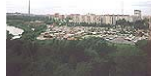
Ekaterinburg, third biggest city in Russia: city view

The airhostesses did not have a problem to speak English to me; it was broken English but I appreciated it very much. The service on the plane was of high standard that you would receive from any other airline.