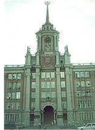
City Council, Ekaterinburg (1947-1954) - built on the place of the Cathedral Temple (demolished in 1930), it looks right in the eyes of bronze Lenin statue.

She gave me the key for my room and when I asked her