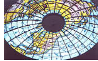
The glass roof with world's map: underground shopping center, Moscow

What struck me in Moscow the most (after the planes that I had seen at the airport) were the old model type of vehicles. The few new vehicles were imported German models. Even the new Russian's vehicles were old-fashioned shapes and mostly dark colored. I found out later that before Perestroika black cars were used in Russia by government elite only, and this is probably why Russians are so in love with black and dark colored cars.