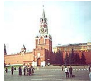
Spasskaya Tower; Kremlin, Red Square, Moscow. The clock on the Spasskaya Tower is called "The Main Clock of the country", and is the standard of time in Russia.