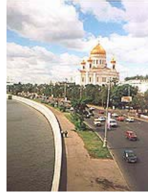
The Temple of the Christ the Saviour: stunning view from the Moscow River

Dmitriy and I had a pleasant conversation on the way from the airport. He was very interested in my country and questioned me all the time. There were some road works and the traffic moved terribly slow even though there were three lanes of traffic going into the city and three lanes coming out of the city. In the middle of the road was an additional lane for emergency vehicles. As we were talking I saw some unmarked motorcars, some with blue flashing lights and some without, driving at high speed in the emergency lane. I asked Dmitriy if that was the police? To my surprise he said no, it was the Mafia, police cars were only the ones that were marked. I was stoned. Then he told me about the Russian mafia, and how powerful they were. Before that I was only aware of the Italian mafia.