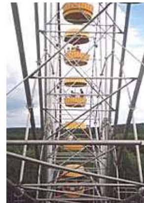
Russian travel can be lots of fun... If you know what you are doing!

(architect Paduchev, 1860-1863). This eclectic 3-storey building is situated in the historical center of Ekaterinburg, right of the dam. Sevast'yanov wanted to plate the roof with gold but the city mayor prohibited it. Sevast'yanov then applied to the Tsar but was told that only church roofs were plated with gold, "So the Lord could notice them more often". For his arrogance Sevast'yanov had to go to church every day in iron shoes and ask forgiveness. Luckily the church - the Temple of Martyr Ekaterina, destroyed in 1930's - was across the road.