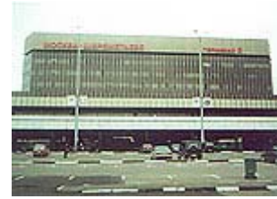
Airport Sheremetevo, terminal 2 (international) Moscow