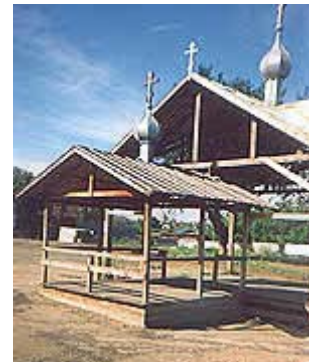
The old wooden chapel (1998) on the place where the House of Engineer Ipat'ev was situated on Vosnesenskaya Hill, in the basement of which the Tsar's family and 2 devoted servants were shot at night 16 July 1918. For many years the building served as the museum of the revolution with the room of execution as the main attraction. The building was destroyed in 1977 according to the secret directive of Politburo.