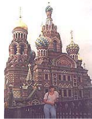
The Cathedral of the Resurrection , Nevsky Prospect, St Petersburg ("Our Saviour-on-the-Spilt-Blood"), one of the most beautiful and famous churches of Russia, built in the memory of the tragic event on 1 March 1881 when terrorists bombed the Tsar, Alexander II - who referred to in Russian history as "Alexander the Liberator" because he freed peasants from the serfdom they had suffered for many centuries, so he actually deserved such treatment less than anybody. It was the 8th attempt of the terrorist organization named "People's Will". One of the members of this organization was Lenin's brother, Alexander Ul'yanov.

I started my research partly out of boredom, partly to find out if I really wanted to do this, or better say, if it could really be an option, would it be acceptable or not.