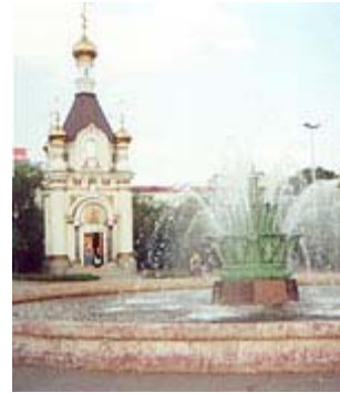
Fountain "Stone Flower" , the Square of Labor, Ekaterinburg. The small church was built in late 1990's, and is now open to the public. Until 1930's the church - the Temple of Martyr Ekaterina, was on this site but it was demolished by Stalin's administration like many others.