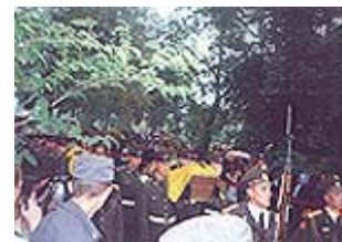
During the ceremony of reburial of the Tsar's family.

At the time of my visit in 1998, the place where tsar Nicolay was killed was in the process of development. There was a small wooden church and some wooden Russian crosses on the premises. A Russian cross differs from other crosses as can be seen on the photos. In the literal translation from Russian it is called "the eight ends cross" and associated with Russian Orthodox Church only. During my visit in 2000 a new wooden church was built and the area was developed. Shortly after my departure from Ekaterinburg in 1998, different services were held for the reburial of the tsar and his family. The one service was held at the civil war monument outside the city (close to which the remains have been found) and another; big service was held at the Vosnesenskaya church in Ekaterinburg which was situated right in front of the (now destroyed) building where the tsar's family was executed. This church used to serve as a museum during the communist era, and was returned to the Orthodox Church only after Perestroika.