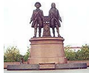
The monument of Genin and Tatischev - the founders of Ekaterinburg. During the Soviet times only one of them was known - the Russian Tatischev. German Genin was not considered by the Soviet propaganda as an appropriate person for the fame of the city founder. The monument was built for the 275th anniversary of the city (1999), and is facing the Dam.