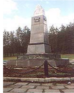
Europe-Asia monument (Old Moscow highway, outside Ekaterinburg)

Ekaterinburg has a lot to offer to a tourist. It has nice eating-places, memorable places to visit, beautiful parks, nightclubs, good hotels, a big dam surrounded by areas developed for leisure, and lakes outside the city as well as pictorial swamps. I would suggest visiting Ekaterinburg during the summer because in winter temperatures can be as low as -35 degrees C (approximately -5 F°). If you include Ekaterinburg only as a part of your trip than I would suggest not staying longer than three days and four nights because while it is a nice city to see it is without doubt not the most beautiful place in Russia. But I enjoyed my stay there.