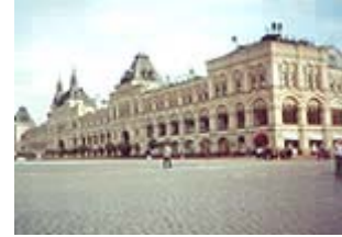
GUM, the state shopping center on the Red Square, Moscow - opposite to the Kremlin; one of the biggest shopping galleries in Europe

A possible future marriage is not a business deal. It is all about feelings, and to me it was a very serious matter. The final decision that you suppose to make after your visit is something that can have its influence on your whole life for the rest of your life. It is normal people's aspiration if they have decided to get married that it will be forever. Visiting the possible future wife in her hometown and meeting her family can strengthen your relationship enormously. At least for me it did, and it was an unforgettable experience too. I spoke to several people that have done it the way I did and they shared exactly the same viewpoint: it is experience of a lifetime. I have visited Russia several times, but none was so