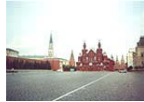
The famous Red Square in Moscow is not red at all! "Red" in Russian language was initially used as an equivalent of "beautiful", so the Red Square would also mean "a beautiful square".

Dating agencies in Russia are making money out of it by asking money from women for sending and receiving letters via e-mail; it is probably the principal source of revenue for Russian agencies.