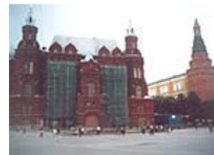
Moscow is becoming prettier with every day: renovations, reconstructions, upgrading of roads and new buildings are changing its look to the one of a modern European capitals (I hope they will reconsider the upgrading of the international airport soon!)