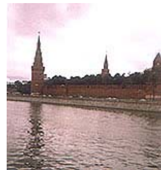
Kremlin: sunset on the Moscow River