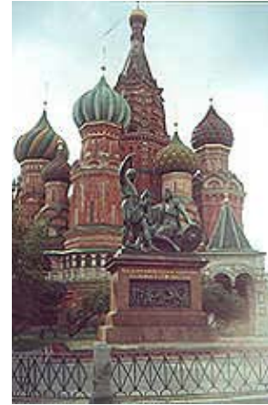
St Basilius, Moscow (1555-1561) - this impressive church on the Red Square became the visit card of Russia

During the weekend I had some time to page through the newspaper more carefully. The last few pages were all about people that were interested in meeting other people. Since I was currently available (I divorced a few years ago, and had not dated much since), I looked through this section with a particular interest. You know, it feels weird to look for the love of your life in classifieds - but hey, who said one cannot just have some fun? (I mean that it is fun to read personal ads; please do not think I meant something else! I am a quiet type that tends to be shy at first, not very adventurous and I am