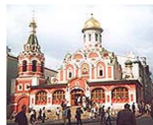
Yet another Moscow church - the Cathedral of the Mother of God's Kazan Icon (1626-1636) on the Red Square. Reconstructed in 1993.