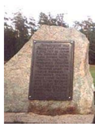
The memorial stone at the Europe-Asia monument says the first geographical sign Europe- Asia was established here in 1837