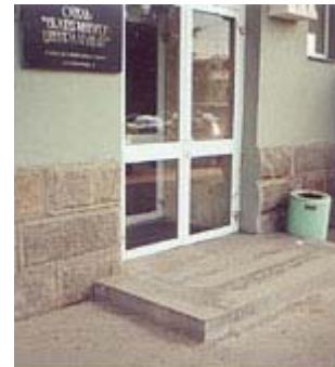
Entrance to the hotel "Tsentralnaya"