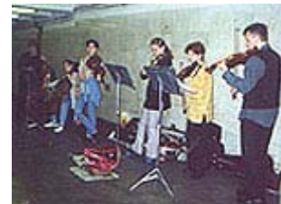
Street musicians at the underground street crossing close to the Red Square: I was told, they are usually students of Conservatory or musical college. They were playing very enjoyable music!