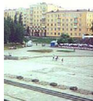
The buildings of 1950's facing the Dam from the other side