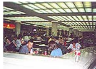
Eatery at the underground shopping center in Moscow close to the Red Square: dozens of fast food cafes and restaurants on the same floor