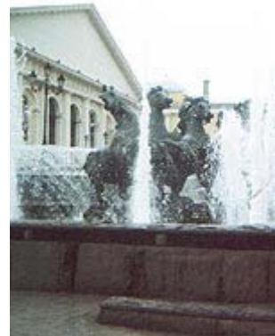
Some things in Moscow look very Italian; like this fountain on the top of the underground shopping center close to the Red Square