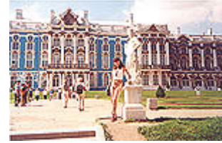
Winter Palace, St Petersburg (built by Italian architect Rastrelli) is the residence of Russian Tsars and the Court since the later half of 18th century. It includes the vast Hermitage Museum and is considered one of the best palaces in Europe for its beautiful architecture and interior decor. It is currently one of the world's biggest museums for fine arts.

Many days and nights after I saw the advertisements in the newspaper and on the Internet, I was pondering with the idea to make contact with Russian women. I could not make up my mind, which way would be the best. I was tempted to buy addresses on the Internet. The reasons being, because you see women's pictures, you start dreaming about them and there are some details about them on the website as well. This way you know who you are writing to - or so you think - but still have the worrying factor that you will never be able to make a real contact with her. The saying, "it is as easy as buying a horse" surely was not applicable in this case.