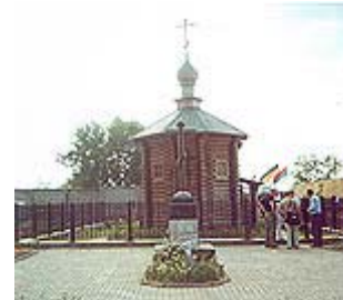
The new wooden chapel replaced the old one (1999). It is planned to build there "the Temple on the Blood in the Name of All Russian Saints". The city administration is currently trying to collect money for the building.

the killing of the last Russian tsar Nicolay II in 1918. During the Communist rule the city's name was changed to Sverdlovsk according to the nickname of one of conspirators of the Bolsheviks' take over in October 1917. The killing of the last tsar took place after the revolution and the establishment of the Bolsheviks party in Russia. Tsar Nicolay II, his wife - a former German princess, their six kids and two devoted servants were executed in the basement of a building in Ekaterinburg. This building (which was a registered historical monument) was later destroyed because the government was afraid that a US delegation that was due to arrive in the city could try to visit the building. The former president Boris Eltsin was the city mayor at the time the building was destroyed according to a secret directive of Politburo.