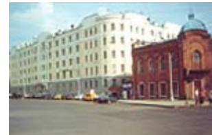
Hotel "Tsentralnaya" (1926), Malysheva Street (formerly Pokrov Anenue) - this is the hotel where I stayed during my visit to Ekaterinburg. The name of the hotel means "central", and it is in fact situated in the historical heart of the city.