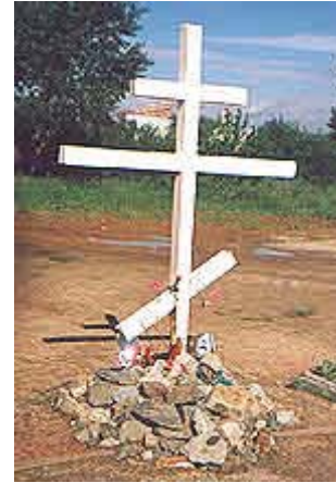
Russian Orthodox cross ("the eight ends cross") on the place of the execution of the last Russian Tsar Nicolay II and his family; Vosnesenskaya Hill, Lunacharskogo Street, Ekaterinburg, Russia. Vosnesenskaya Hill is the highest place of the city.

Ekaterinburg was named after Ekaterina, the late wife of tsar Peter The Great. The city is probably best known for