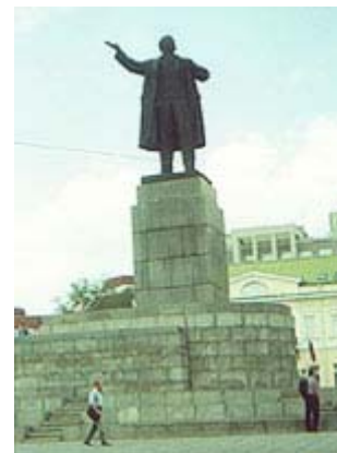
Statues of Lenin still can be found in almost every Russian city or town; this one is proudly standing on the central square of Ekaterinburg, the Square of 1905 year (formerly the Cathedral Square), named in memory of the first Russian Revolution of 1905.