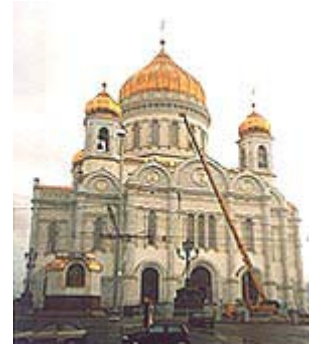
The Temple of the Christ the Saviour , Moscow.

If there is enough time available between the flights, I would advise you to take an excursion around Moscow. This is what my travel agent did for me. I had to wait twelve hours for my connecting flight to Ekaterinburg, and the excursion was supposed to fill the gap. I know some people enjoy sightseeing on their own but with a personal guide it is so much better. It was not cheap but it was definitely worthwhile (I believe most good things are not cheap). If you were flying to one of the regional cities in Russia (or Ukraine, or Belarus) it would be a