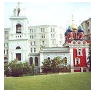
During the Soviet times churches (the ones that had not been destroyed) were painted in pale colors to make them "invisible" - now they paint them bright colors. This church (also at the hotel "Rossia") is half-renovated: can you see the difference?