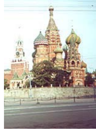
St Basilus Cathedral and the Spasskaya Tower; view from the hotel "Rossia" in Moscow

At the time I placed my ad I was 43 and I was looking for a woman from 28 to 35. The reason why I chose this age group was that I was hoping to have kids with her and the most important fact for me was that she would want to settle down.