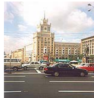
Moscow: city center