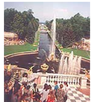
Magnificent Great Palace at Petrodvorets, Peterhof (a place outside St Petersburg), the abundance of fountains, gold and greenery. Below: The sculptures at the Palace are gold plated!