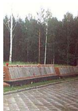
The names of tsar Nicolay II and his family were just a few names on this huge list at the monument of civil victims outside Ekaterinburg