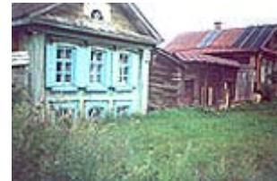
This is what Russians are used to call " a private house " - a small wooden construction, most often without water connection or sanitation.