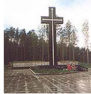
The Black Cross close to Ekaterinburg at the civil victims monument (Moscow highway). Its height is approximately 11 meters (12 yds)