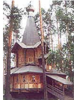
Wooden church at the graveyard (Uralmash, Ekaterinburg)

The church on the graveyard premises was built of wood and was there merely to serve the purpose. That building was a total contrast to the other Russian Orthodox Churches that one will find in Russia. Churches in Russia are known for their wonderful architecture and gold plated roofs. I think Russian churches are one of the biggest attractions to foreign tourists. The most famous church is probably St Basilus on the Red Square in Moscow because of its location. For me, the most