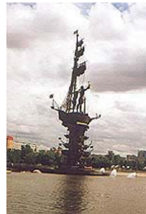
Monument to Peter the Great (Peter I) on the bank of the Moscow River, built in 1990's. In fact, Peter had never been a very fond of Moscow; St Petersburg was his child and the love of his life. Since Peter moved the capital to the new founded St Petersburg, the two cities always competed with each other, with one of them being the official capital, and the other being "the second capital". Peter moved the capital to St Petersburg trying to introduce a new, European style of life to Orthodox Russia in the beginning of 18th century, after the revolution of 1917 Lenin moved the capital back to Moscow trying to distance the new Soviet State from