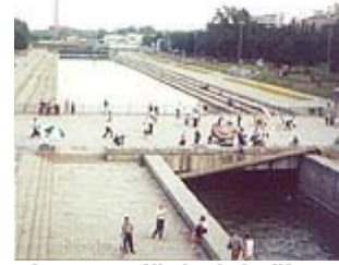
The Dam ("Plotinka") - the historical center of Ekaterinburg and the popular place of leisure. Ekaterinburg was founded in 1724 according to the directive of Peter the Great.

Another memorable supper was the last night before my departure. We went to another top class restaurant.